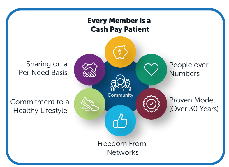
What Makes Medical Cost Sharing Unique